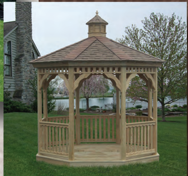
10' wood octagon with shakewood asphalt shingles.

The octagon gazebo is our basic model; but with a broad variety of options to choose from, it is also one of our most popular.