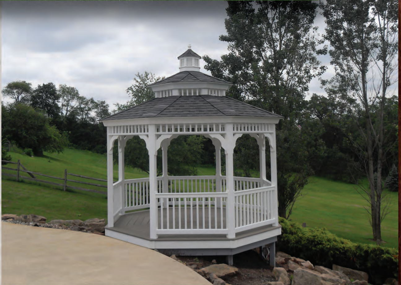
12' vinyl gazebo with double roof, fox hollow gray shingles, and gray floor.

This 12' gazebo is shown with clay paint, and a double roof with water repellent.